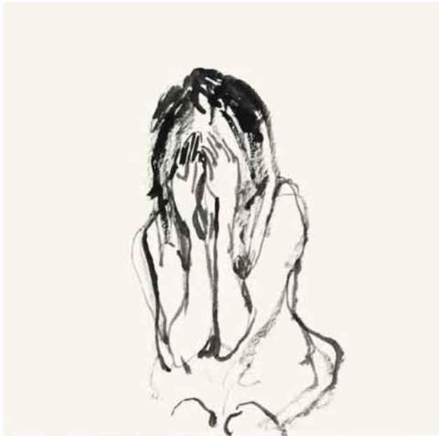
Tracey Emin's She Kept Crying (2012) in the artist's new Lehmann Maupin show

CLOSE LOOK: TRACEY EMIN'S RAW AND REVEALING NEW WORKS AT LEHMANN MAUPIN GALLERY